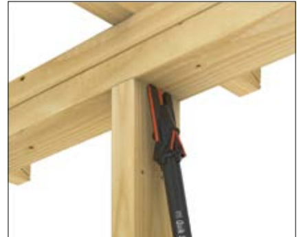
Wide-face stud to top plate.