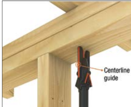
Truss rafter offset from stud.