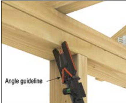
Narrow-face stud to top plate.