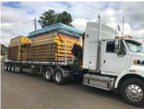
6 units of cassettes arrive at site

Location: Lismore, NSW Supplier: Eastlands F&T Builder: Bennett Constructions Products: Floor cassettes for 6 unit development Other: Detailing and pre-cut components by Meyer Timber NSW