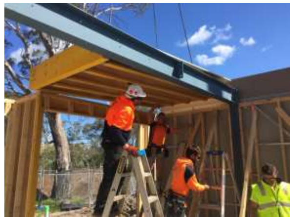
Steel beams – no worries.