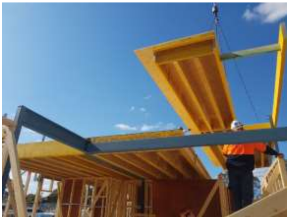
Stair void built into design