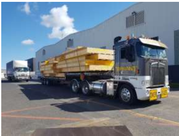
2 units ready for delivery

Location: Noble Park, VIC Supplier: Complete Frames Builder: Level 10 Products: Stressed Skin "Qikpanel" floor systems for 64 unit development Other: Detailing by Meyer Timber NSW, assembly by TBS, pre-cut ducting/plumbing holes