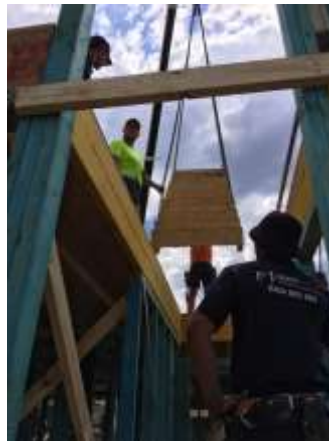
Lifting into position