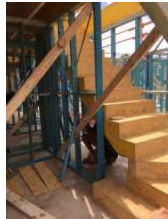
Job completed and ready for use

“Instant access which is safe and permanent. It makes life much easier for follow on trades.”