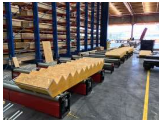
Stair unit fully assembled