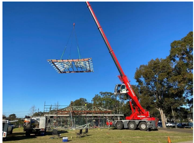
Final piece of structure craned into place

“Recycled Hardwood Posts and GL21S Beams machined and pre-coated by Meyer Timber”