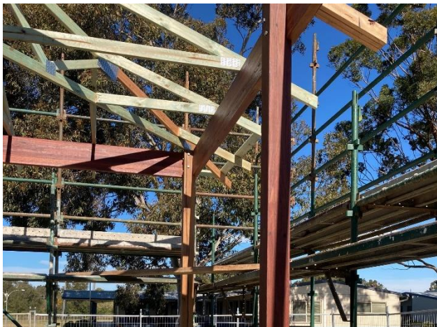
Posts, beams and trusses assembled on site