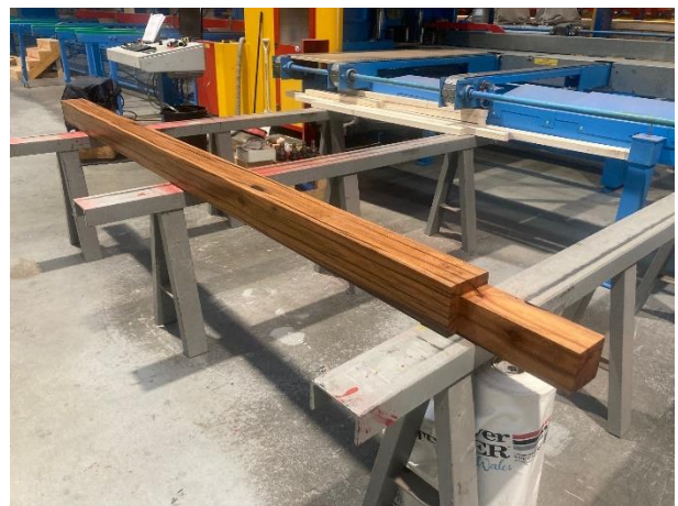
Post machined and oil pre-coat applied