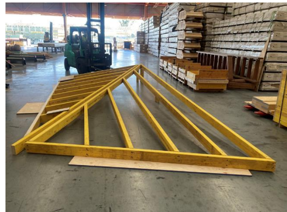
Roof panels assembled and checked in factory

“Extremely steep site makes modular building a must. Boundary pushing design leads to project success”