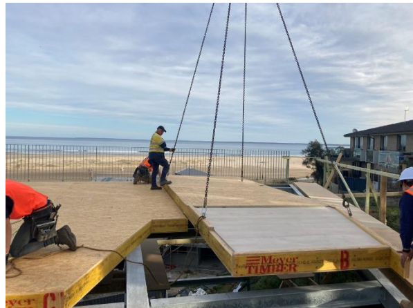
Complex floor installed in 3 hours