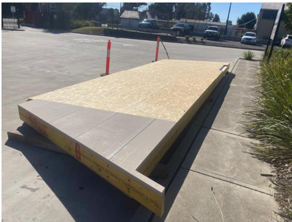
Floor Cassette manufacture Meyer Timber NSW

Location: Gerroa, NSW Supplier: Wadsworth Joinery Products: Floor cassettes, rafter cassettes Other: Detailing and manufacture by Meyer Timber NSW