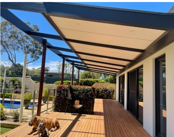
Even the dogs are happy

Not only did the project require an attractive timber product that provided dimensional stability and durability, it was its strength that was particularly helpful in this instance.