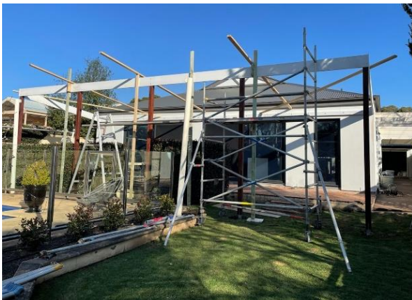
Posts and Beams erected