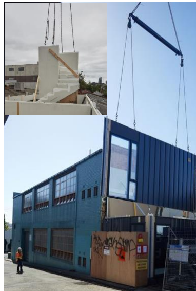
Installation in full flow-floor cassette (left), Wall panel and Staircase.