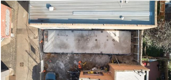
Aerial view of the slab depicting the small footprint