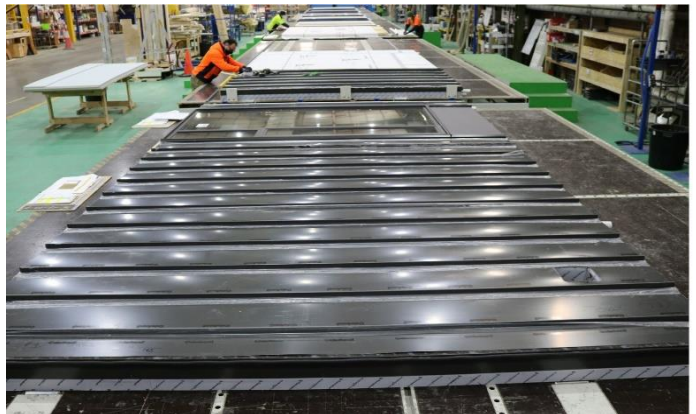
Production of external walls in progress