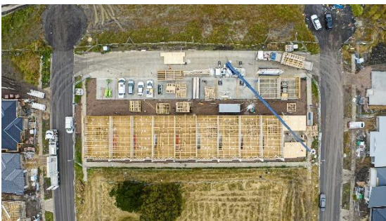
Aerial view of the site under construction