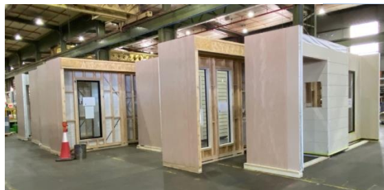
The Front-End Modules (FEM) in the factory and being lifted into place on site (right)