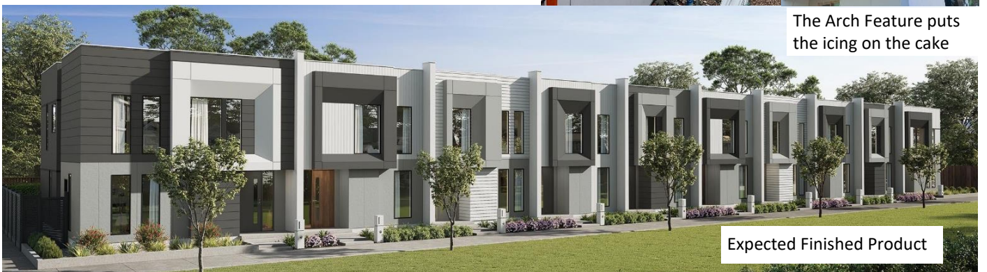
Expected Finished Product

The panels were transported to site by 30 well-orchestrated trucks, and installed to lock up stage in just 10 days