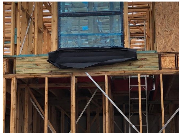
Wind Beam installed on site