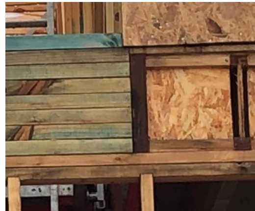
No flooring strip required on top

“Fast and simple installation with good spans and matches 90mm wall width perfectly”