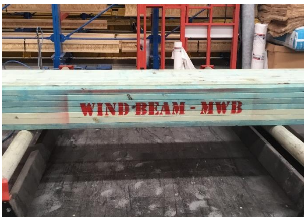
MWB assembled in factory

Location: Riverstone, NSW Supplier: LL Frames & Trusses Builder: Bathla Projects Products: Meyer Timber factory manufactured wind beam (MWB) Other: Innovative solution engineered by Meyer Timber