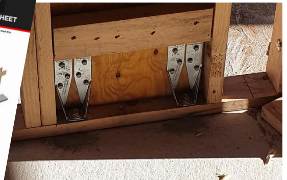
Anchorage (view from inside)