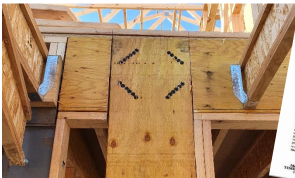
Knee joint (view from outside)