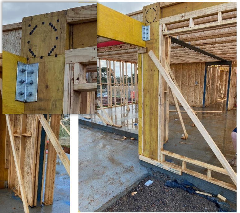
Left Knee joint and external beam connection