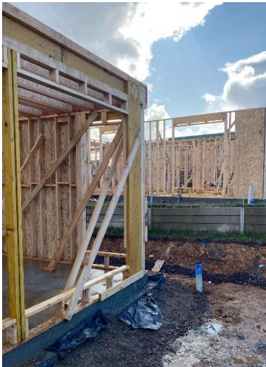
A view from outside