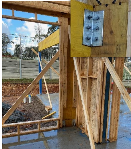
Anchorage (viewed from inside)