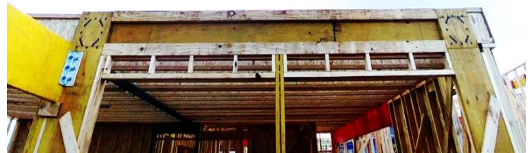
Overall view of the 3820mm window opening with central mullion