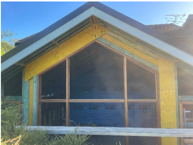
Central Raked Window