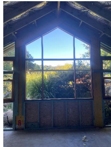
Lower frame adds stiffness