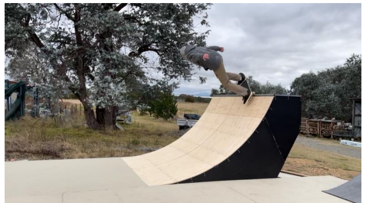
Maiden Test Run is a Success

“Timber can be used successfully for many things if detailed correctly”