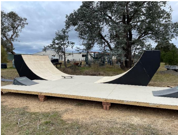
Skate Ramp completed