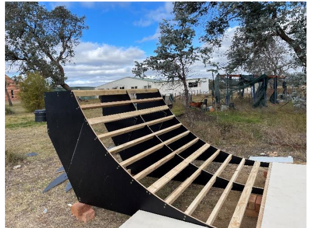
Transition Framing completed