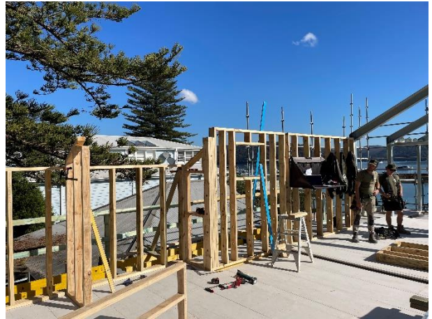
First Floor Wall Frames