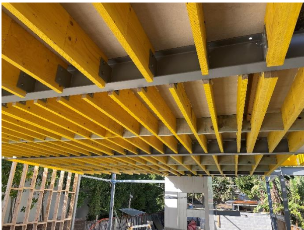
Ground Floor Joists