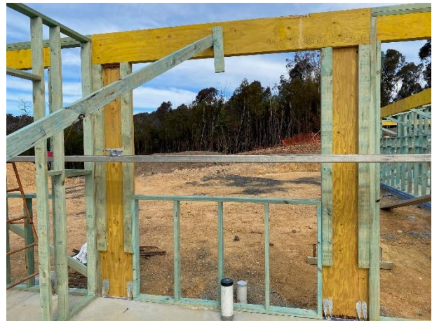
Simple screw bolt tie-down

“The meyBRACE solution was much simpler and quicker and cheaper to install”