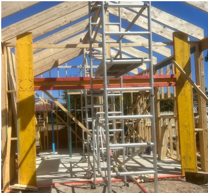
meyBRACE under construction – view from outside