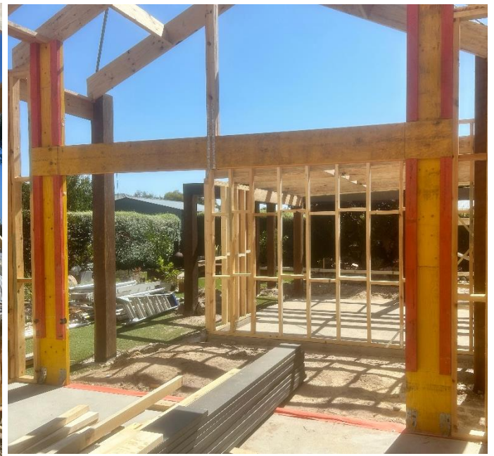
meyBRACE under construction – view from inside

With extended columns, meyBRACE offered the added benefit of reduced framing around the opening.