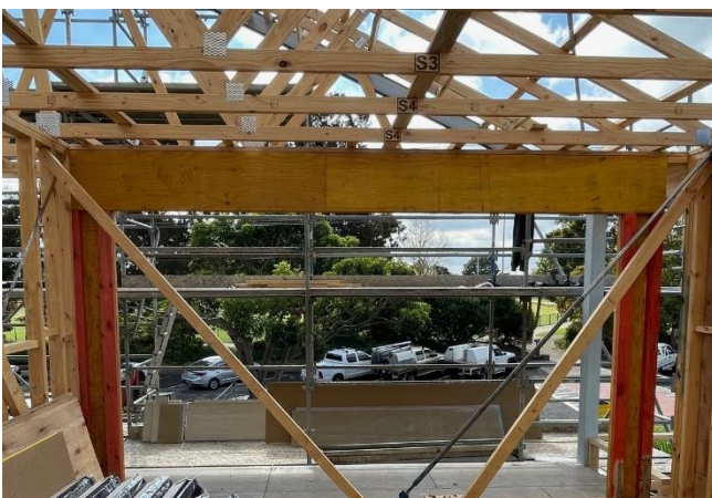
Fully installed meyBRACE (view from inside)