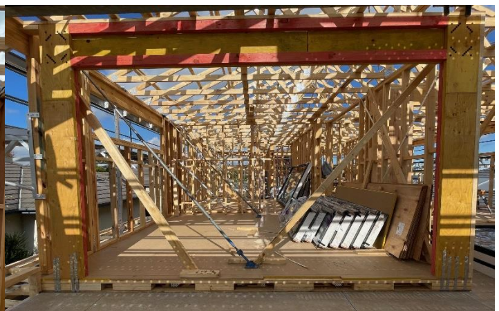
... and a view from the balcony

“installation of meyBRACE was a breeze and took us just a matter of minutes. Awesome!”- quote by the builder