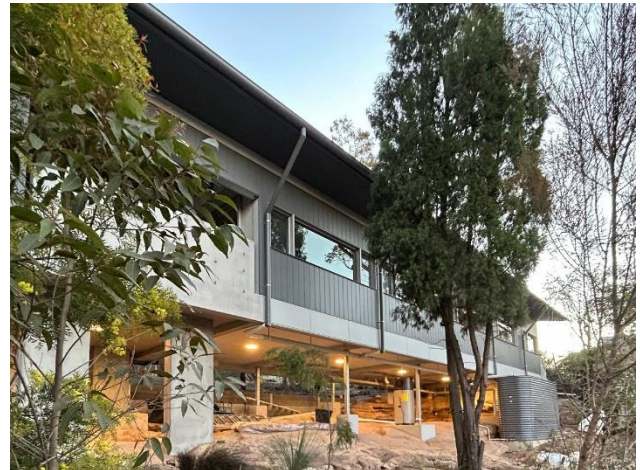
20 weeks – home completed!

“Precut components saved time and waste. The next step is floor, wall, and roof panels direct to site.”