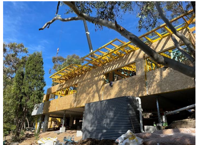
External view during construction