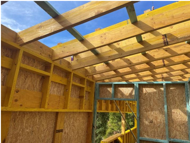
Internal view during construction