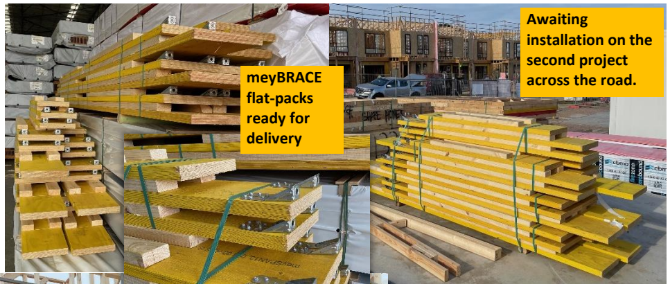
Awaiting installation on the second project across the road.