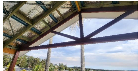
A view from the inside