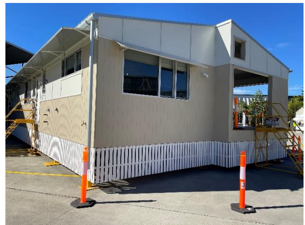
Impressive alfresco area with overhangs