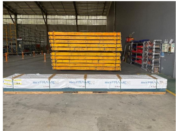
Roof cassettes and meyFRAME12 LVL framing