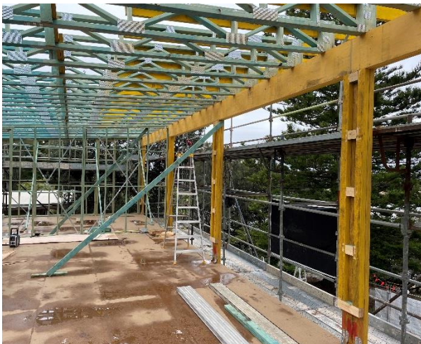
First floor meyBRACE viewed from inside