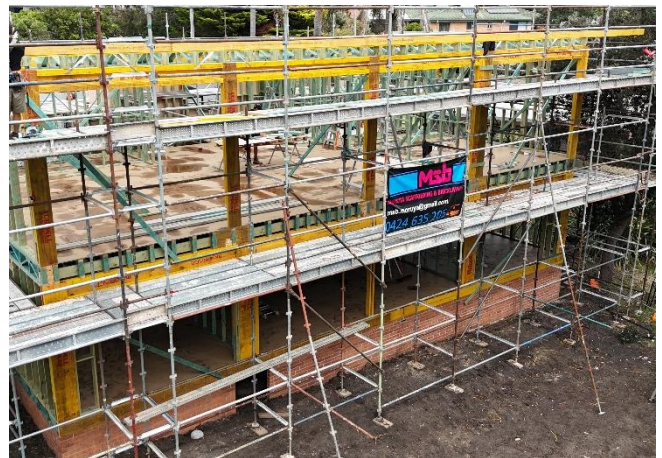
Completed front wall