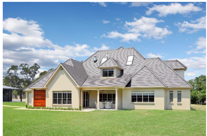
The end result